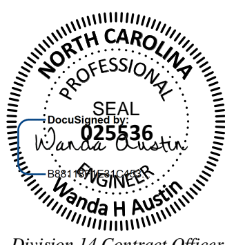
Division 14 Contract Officer

Accompanying this bid is a bid bond secured by a corporate surety, or certified check payable to the order of the Department of Transportation, for five percent of the total bid price, which deposit is to be forfeited as liquidated damages in case this bid is accepted and the Bidder shall fail to provide the required payment and performance bonds with the Department of Transportation, under the condition of this proposal, within 14 calendar days after the written notice of award is received by him, as provided in the Standard Specifications; otherwise said deposit will be returned to the Bidder.